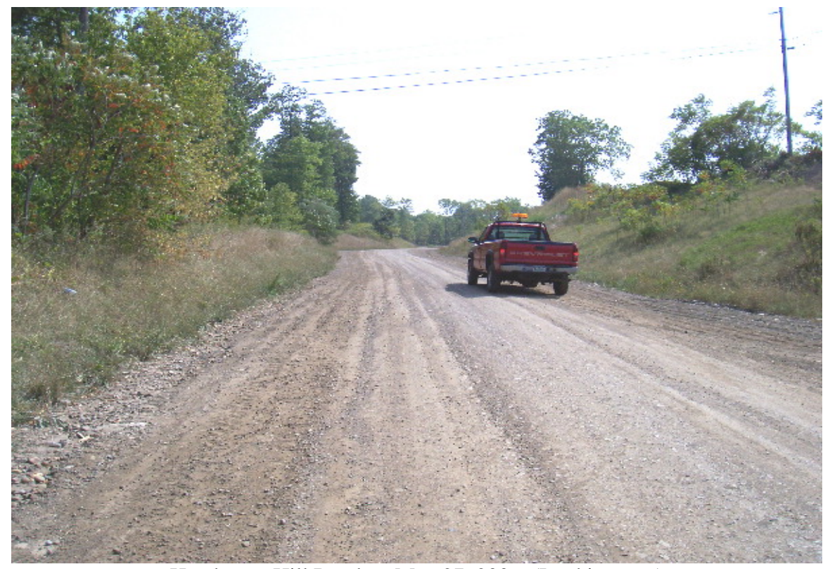
Henderson Hill Road on May 27, 2006. (Looking east)

During 2008 the Department was able to rebuild Henderson Hill Road with the assistance of a $129,000 Department of Environmental Conservation erosion control grant.