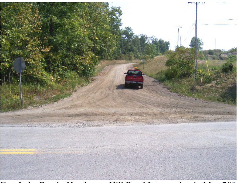
East Lake Road - Henderson Hill Road Intersection in May 2006.