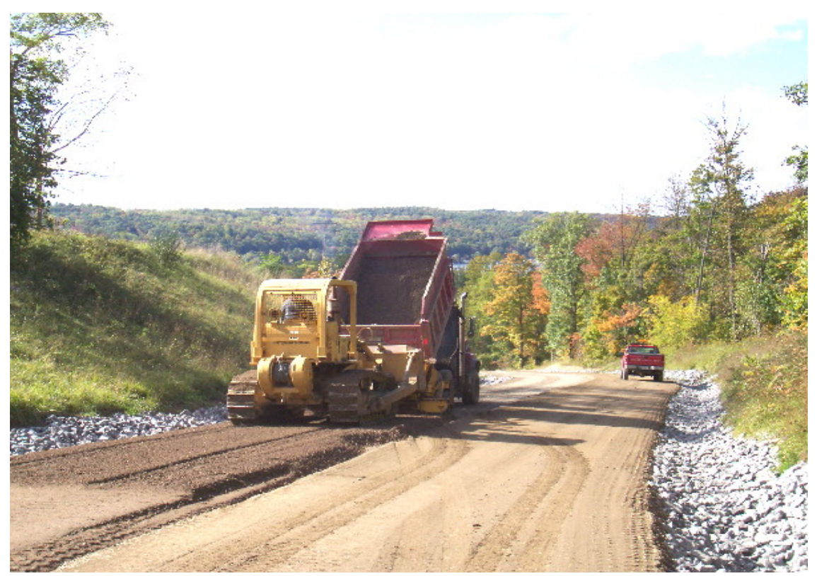
Finished with ditch construction and spreading new crushed gravel on the road using the "Jersey spreader". The spreader allows for a control width and depth of gravel. 12 inches of gravel was applied to the road which compacted to approximately 7 inches.