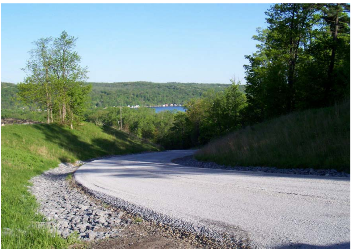
Taken after the road was oil and stoned on May 14, 2009. With the roadbed sealed the danger of road bed eroding is completely negated.