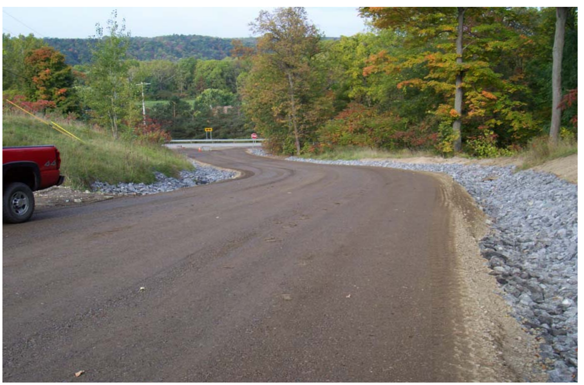
Taken September 2008, the roadbed finished and ready for oil and stone in 2009