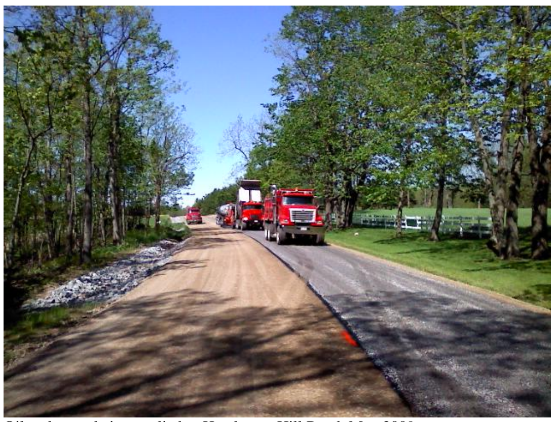
Oil and stone being applied to Henderson Hill Road, May 2009