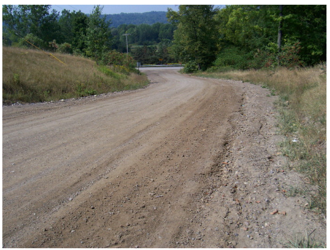
This photo shows the erosion problem (looking west). The East Lake Road is visible in the distance and Conesus Lake is just a few hundred feet further to the west.