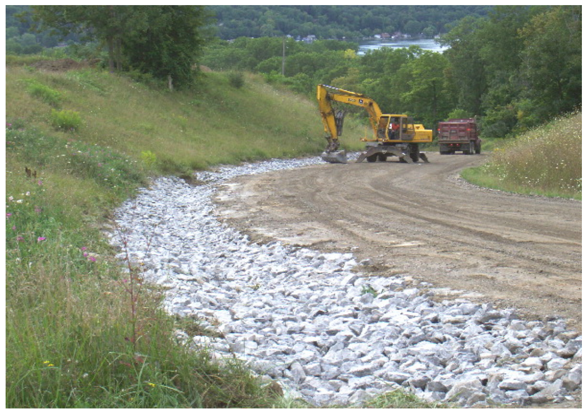
Although it appears that the new ditches are extremely shallow, the depth of the ditches includes over 3 feet of fill stone. Conesus Lake is visible in the distance.